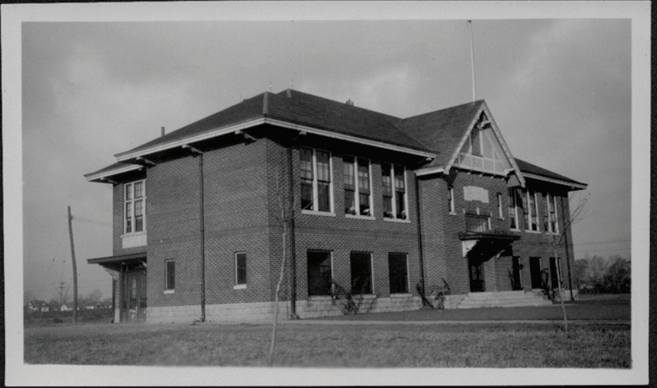
St. Cecile School, Riverside