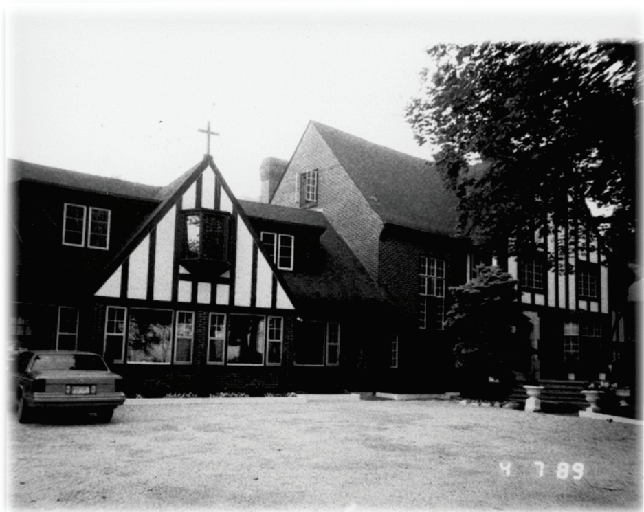
Holy Rosary Convent