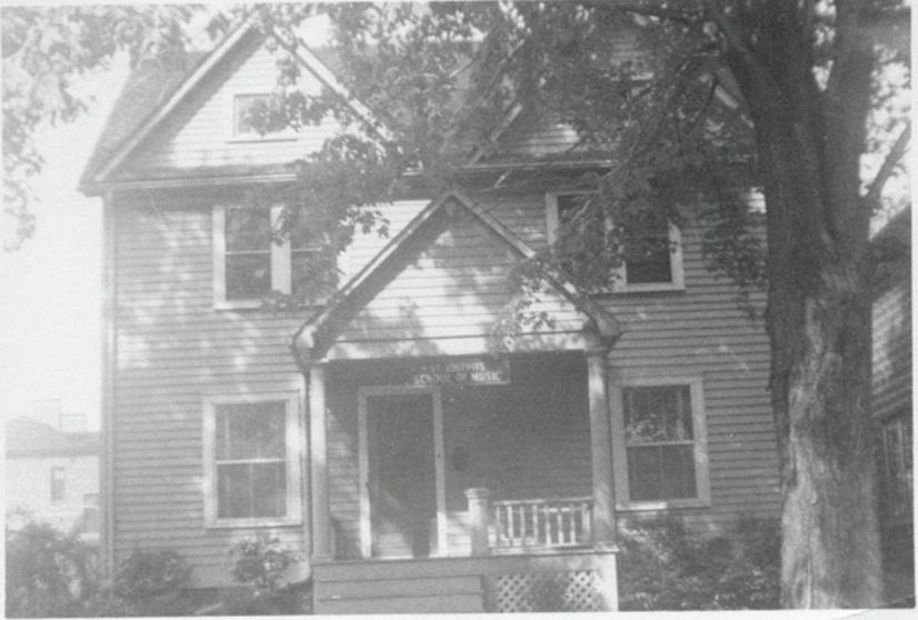
St. Joseph's Convent, 377 Cameron Avenue