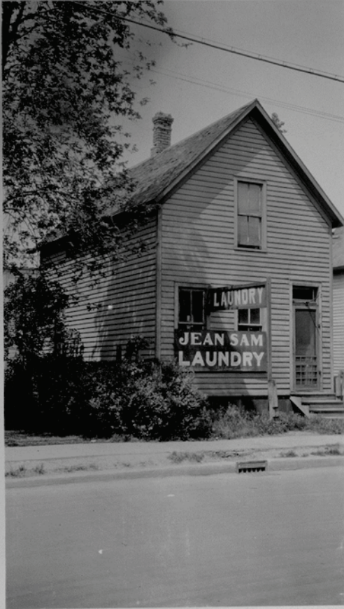
Our Lady of the Lake Convent then Jean Sam Laundry, Drouillard Road

of Windsor. In 1971, with the closing of St. Mary's Academy, girls were allowed to attend Assumption College.