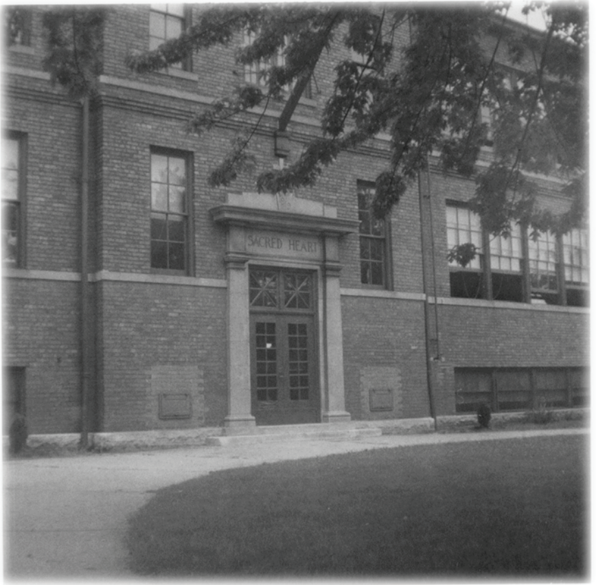
Sacred Heart School