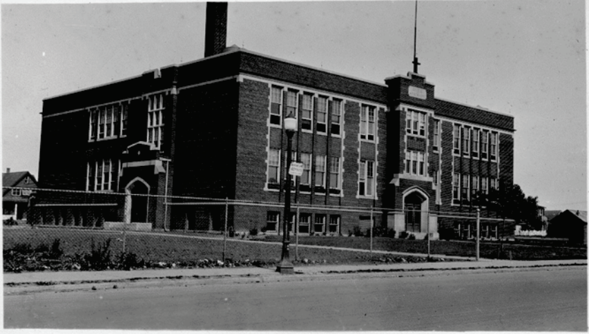
Holy Rosary School, Drouillard Road