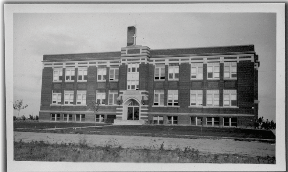
St. Jules School, Norman Road