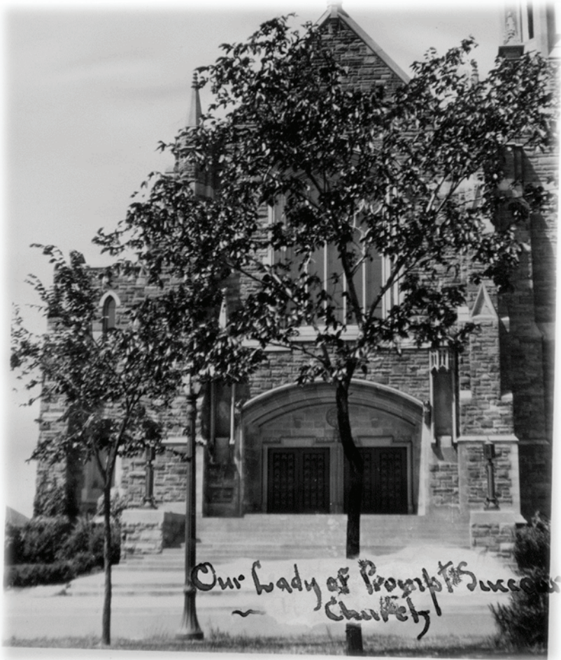
Our Lady of Prompt Succour Church

Sisters' arrival at Notre Dame du Lac. The students observed the occasion with a presentation depicting the parish's growth from a