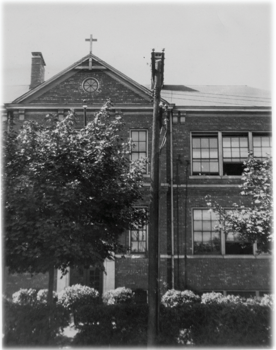
Sacred Heart School