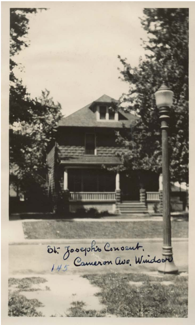
St. Joseph's Convent, 145 Cameron Avenue