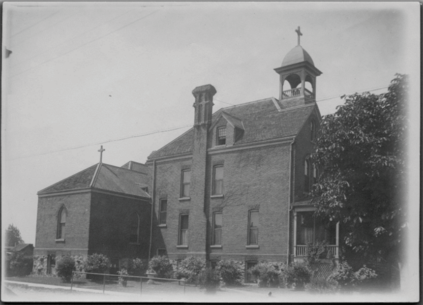
St. Joseph's Convent, 267 Cadillac Street