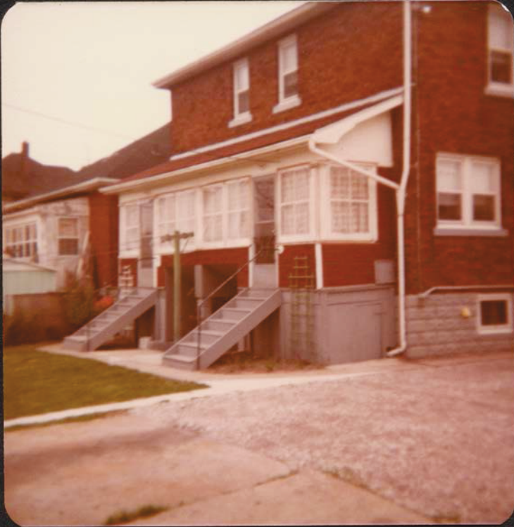
Home for Women in Need

who had been living there alone since January of that year, moved to Holy Rosary.