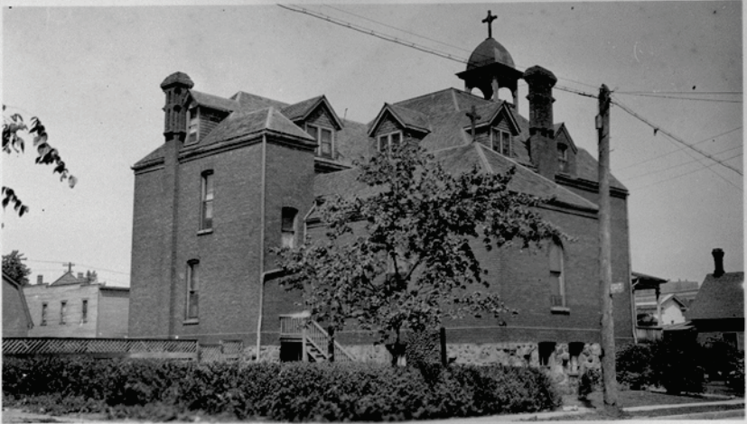
St. Joseph's Convent, 267 Cadillac Street