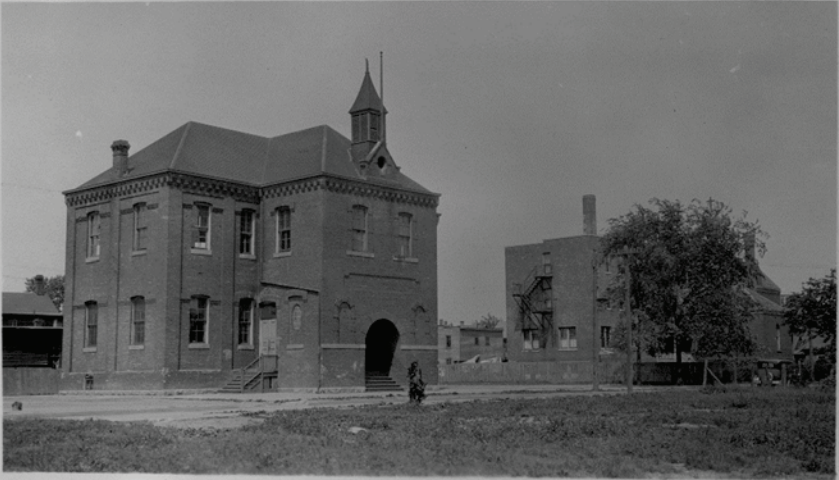
Notre Dame School, Cadillac Street