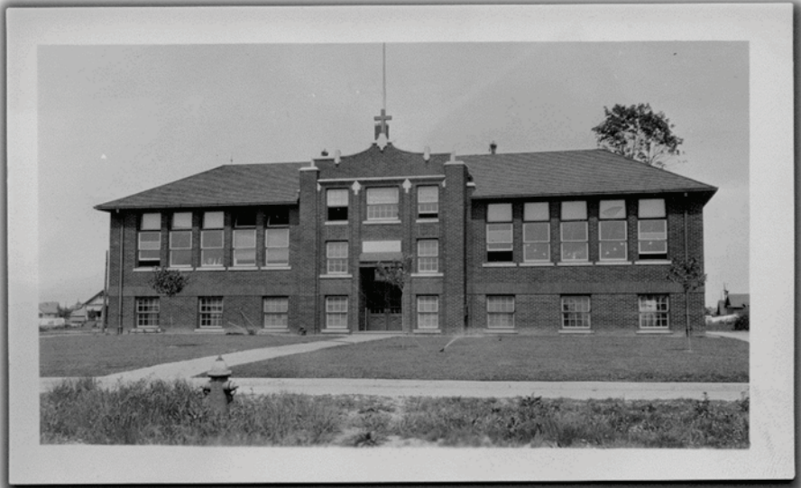
St. Thomas School, Riverside