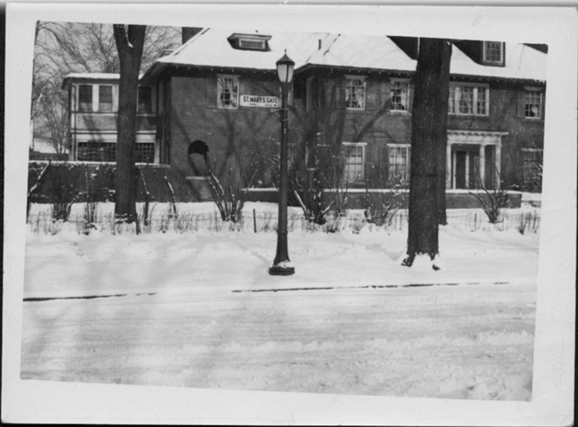
St. Anne's Convent

St. Anne's Convent opened for the school year in September 1954, with the smallest number of Sisters in residence. In 1958, the Sisters learned the house was up for sale with a plan to purchase a property near Assumption University where younger Sisters could take advantage of the opportunities of living close to the university. This new property became St. Joseph's House of Studies. With the new property purchased in 1959, St. Anne's Convent was still looking for a buyer. It was not sold until March 28, 1961 for $25,000. The last of the Sisters moved on April 15, 1961 to St. Joseph's House of Studies and Holy Rosary Convent.