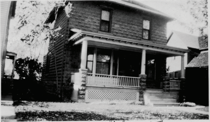
St. Joseph's Convent Windsor.