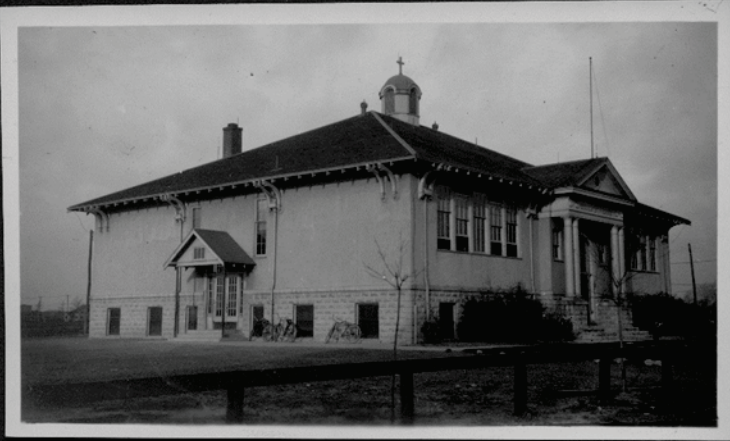
St. Peter's School, Riverside