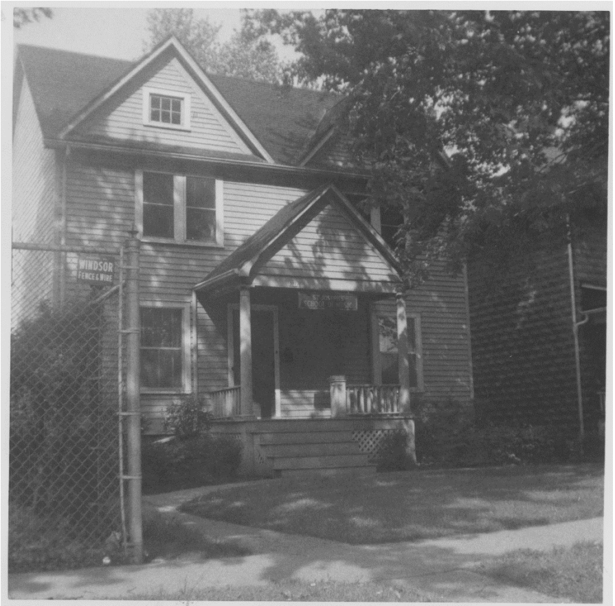
St. Joseph's Convent, 377 Cameron Avenue

Year after year, the Sisters at St. Joseph's Convent remained dedicated to their teaching positions at Sacred Heart School. The Sisters also gave music lessons, both at the school and at the convent.