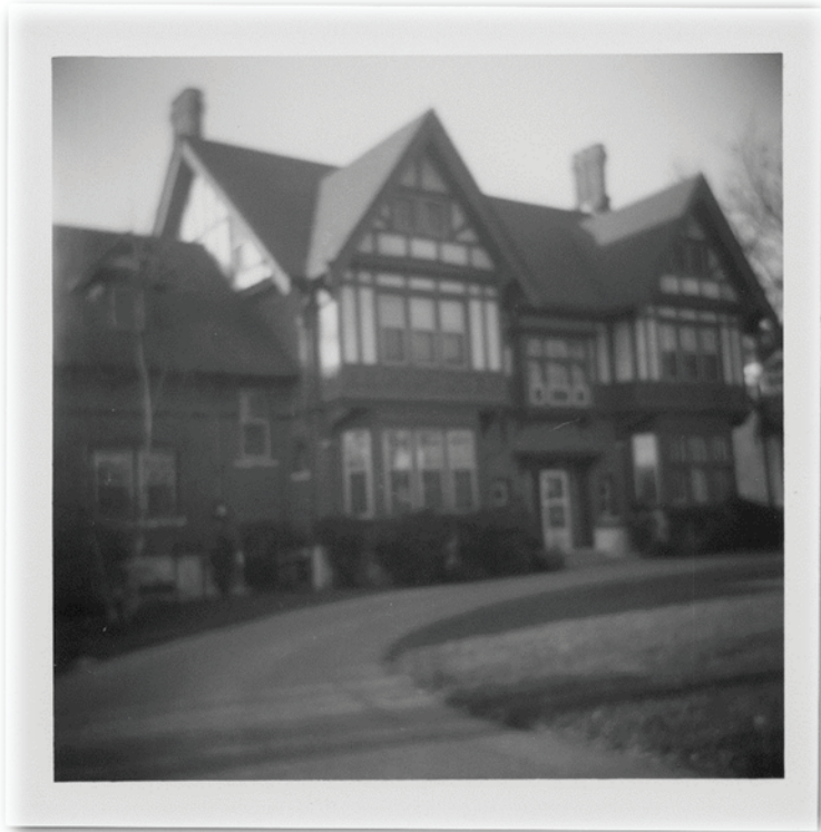
St. Joseph's House of Studies

recommended by the City of Windsor Fire Department Hall. The owners of the construction company, the Odette Brothers, estimated that it would take two to three months for renovations to be completed, but this did not prevent the Sisters from St. Joseph's Convent, from moving there on November 27, 1959, before final completion in 1961. The Sisters of St. Anne's Convent finalized their move on April 15, 1961, joined by two Sisters who taught at St. Anne's and Sacred Heart schools.