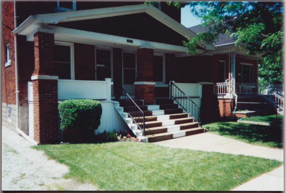
Adult Spirituality Centre, Brock Street

groups. Generous donors made it possible for those on lower incomes to attend programs offered by the Centre.