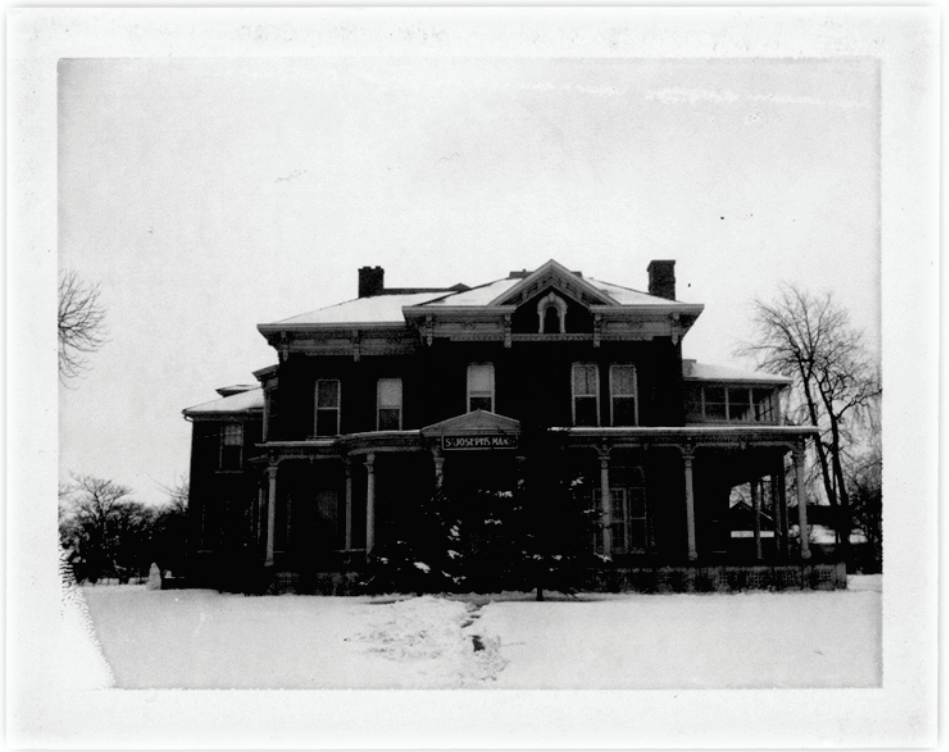
St. Joseph's Manor

installed in the Hiram Walker Museum. In 1970, the new building – located at 1671 Riverside Drive East – was completed and named the Roy J. Bondy Children's Centre.