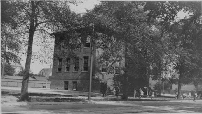
St. Anne's School