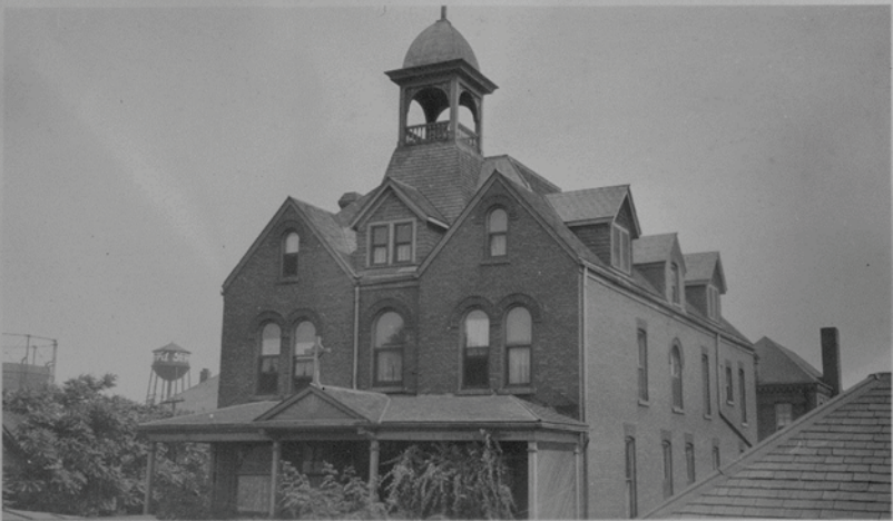
St. Joseph's Convent, 267 Cadillac Street