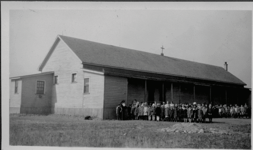
St. Bernard's Bungalow School, Meldrum Road