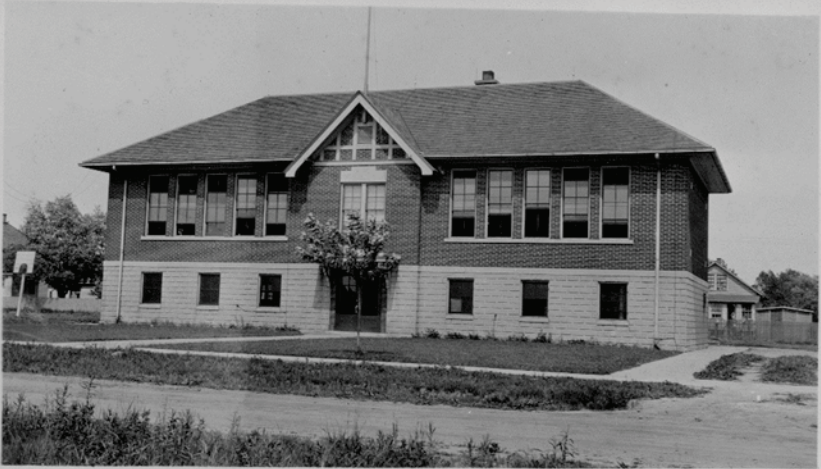
St. Therese School

By 1968, there were 26 Sisters of St. Joseph teaching in 14 schools in Windsor. During the 1982 school year, the Windsor School Board encountered financial woes and fell into a $3 million debt. The school board asked all employees to give up a percentage of their salaries to compensate. Some secretaries were laid off for two weeks in June, and 91 permanent teachers were laid off; additionally, some occasional teachers' contracts were terminated. Eventually, a settlement was reached that involved the teachers giving up a portion of their salary.